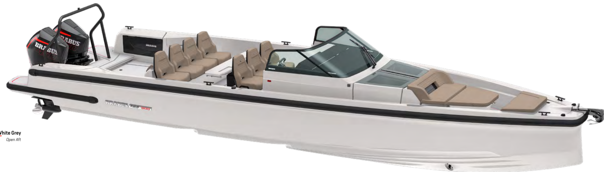
White Grey Open Aft