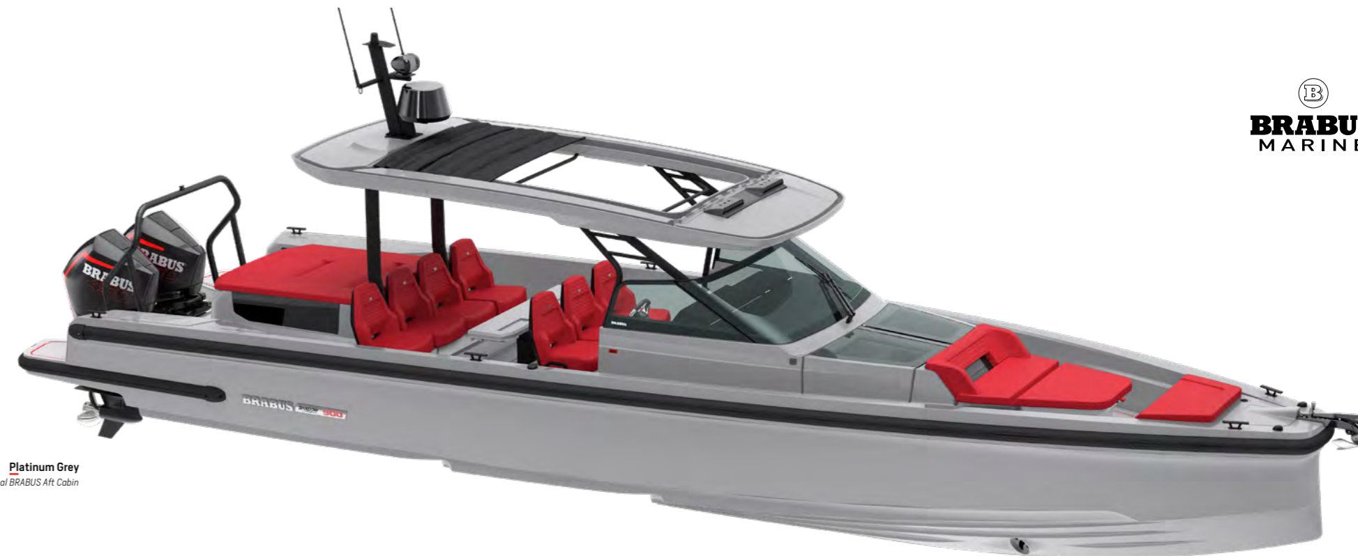
Platinum Grey Optional BRABUS Aft Cabin